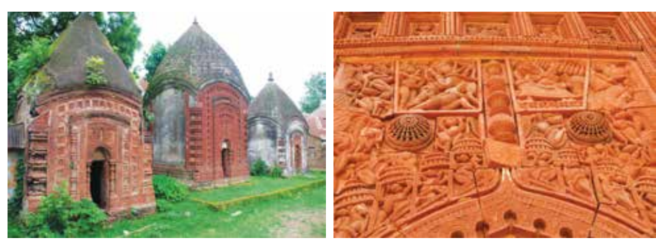
Terracotta Temples in Village Maluti, Jharkhand

We have also been encouraging interns to become involved with some of our projects. Recently a graduate from the Indian Institute of Management, Raipur spent two months in Hariharpur in Azamgarh. He has produced an extremely useful and lengthy report highlighting the impact of our activities on the community, and suggesting areas for further action to meet the needs of