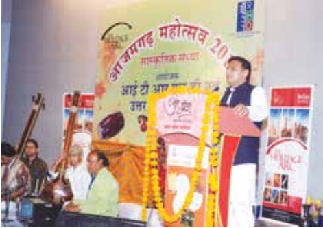
Inauguration of Azamgarh Festival at Lucknow