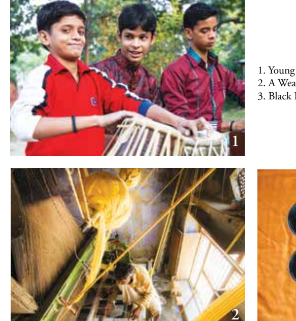
Young Musicians from Hariharpur A Weaver from Mubarakpur Black Pottery from Nizamabad

Until recently the school was functioning in a rented building, but thanks to the initiative of an international team of young architects, under the auspices of the British Council, we were able to complete the first phase of a double storied building with 4 rooms at cost of about 20 lacs. We have now commissioned a contractor to complete a multi-purpose hall-cum-dining room with ancillary facilities. Another classroom will be constructed with funds provided by a Minister from his discretionary fund. We hope to find further funding to complete the school buildings and a request for this is pending with ONGC.